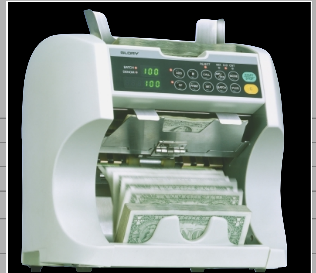
GFR-S Series Currency Counters/Discriminators