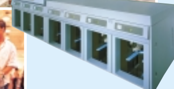
UW-200 Currency Sorter