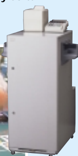
PD-61 Cash Dispenser