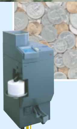
WR-400 Coin Wrapper